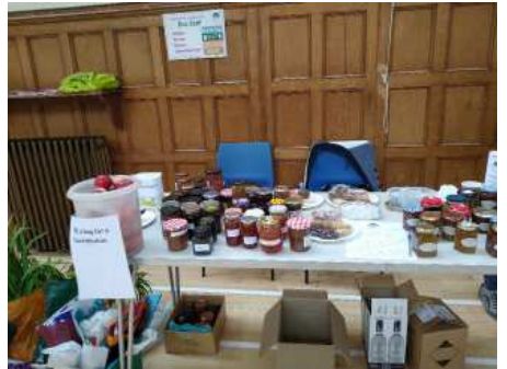
An Eco-Group stall with free fruit and veg, with jams and chutneys for sale