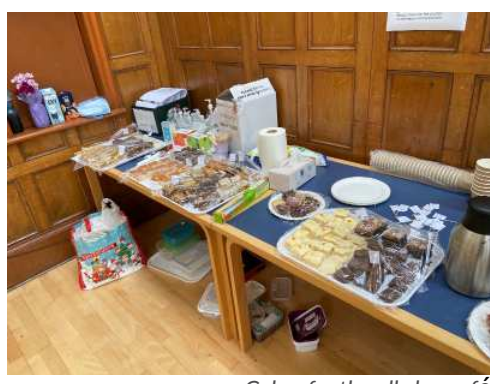
Cakes for the all-day café

The church was handsomely decorated for harvest, and that together with the warm welcome at the church door ensured a rewarding experience