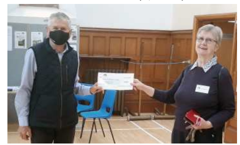
A £250 cheque was presented to the Treasurer of the Friends of the Braidburn Valley Park for fruit trees