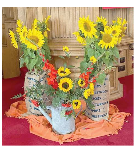
The Church was decorated for Harvest