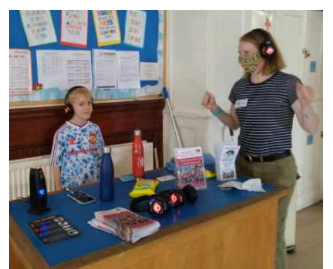
Young Church had a Silent Disco