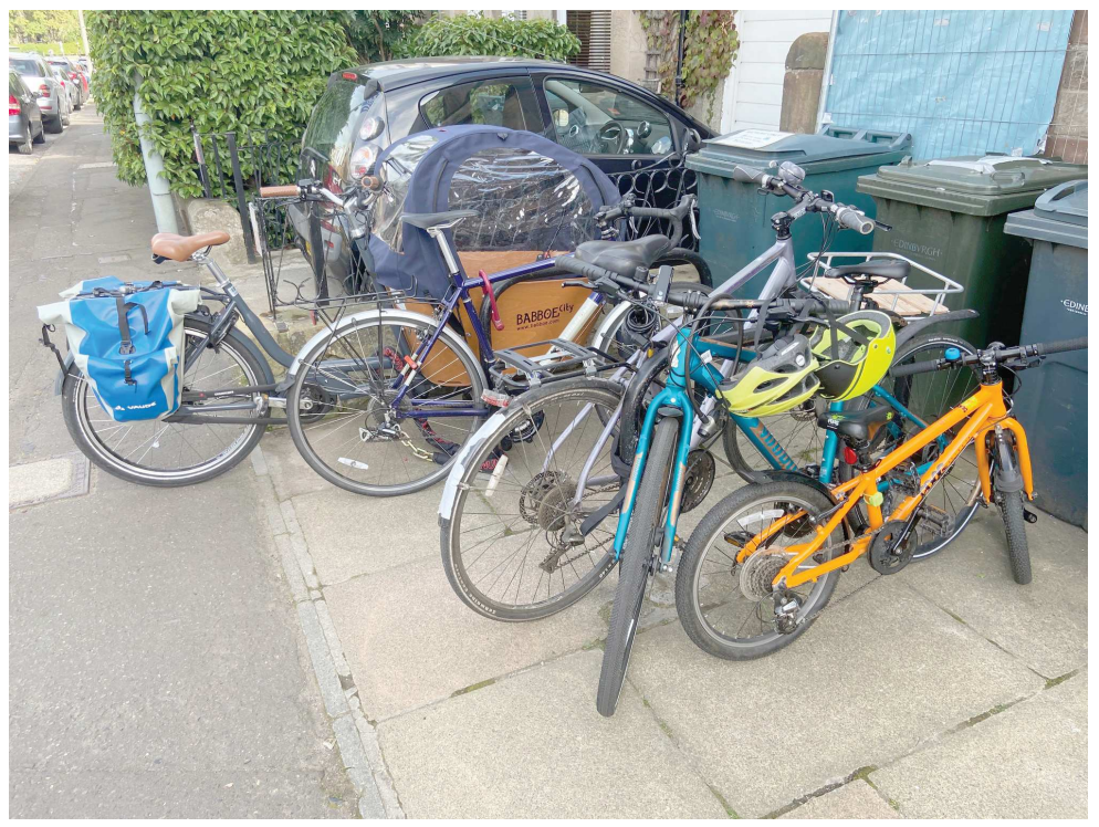
Visitors to the Saturday 25th September Open Day on the Big Weekend filled the bike park