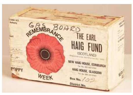
An early collection box

In 1921 Earl Haig noticed some French widows selling silk poppies to raise funds for disabled servicemen. They were inspired by Lt Col John McCrae's poem, "In Flanders Fields". The Poppy was one of the few plants that survived the churned-up battlefields of Flanders growing by the thousands amidst the chaos and destruction.