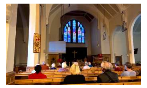
The film show "Thank You For The Rain"