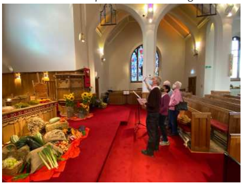
Conducted tour of the church and stained glass