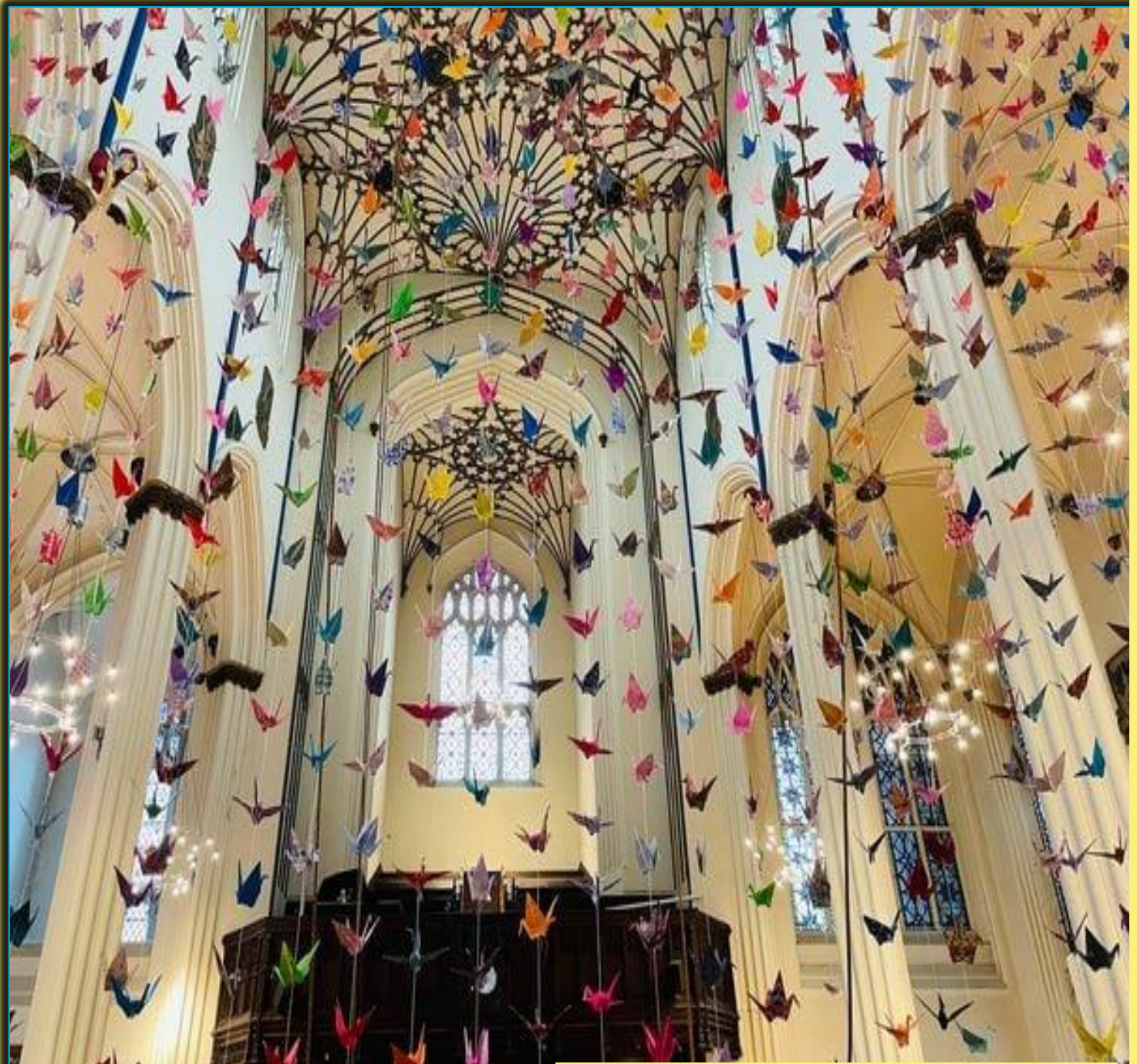
Peace Cranes Exhibition at St John's Church, Princes