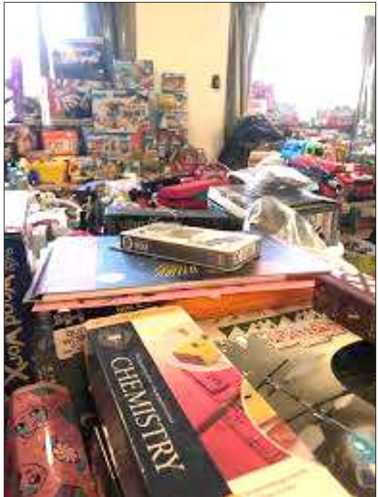
The Jumble Sale is a community event