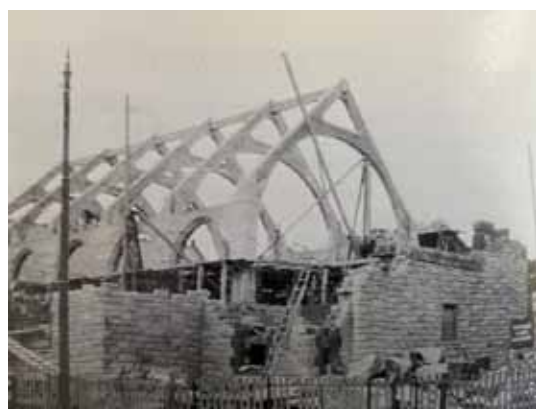
From the Archive: the innovative concrete structure for the new church 1927