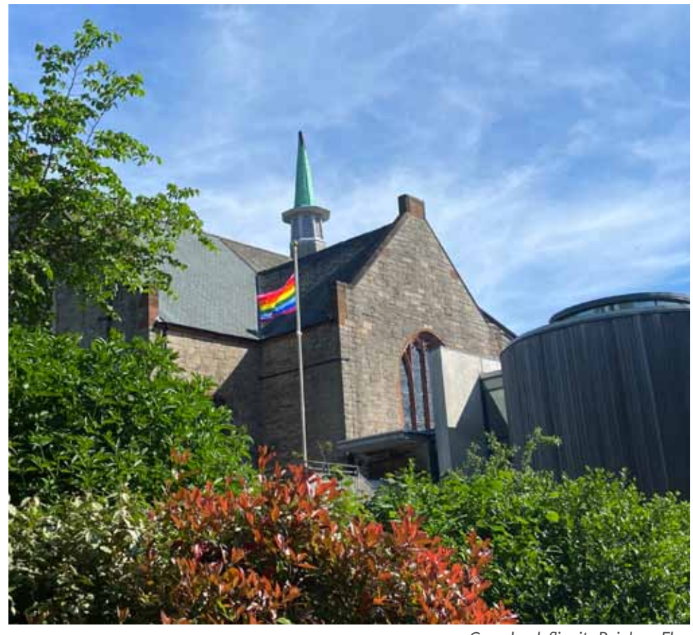
Greenbank flies its Rainbow Flag