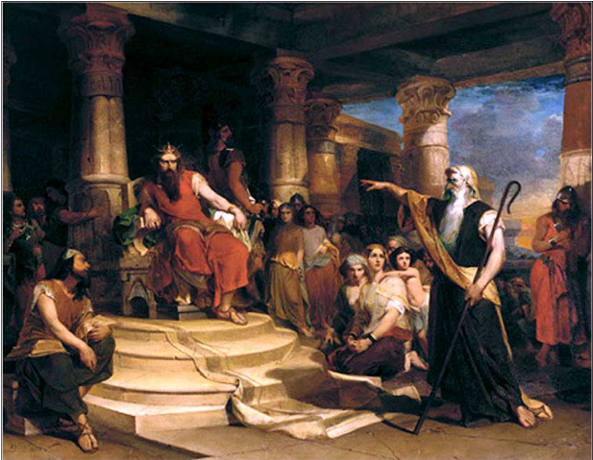
Thou Art The Man , Peter Rothermel. 1884

Peter Rothermel's Thou Art The Man is a favourite of mine for a bit of imaginative contemplation.