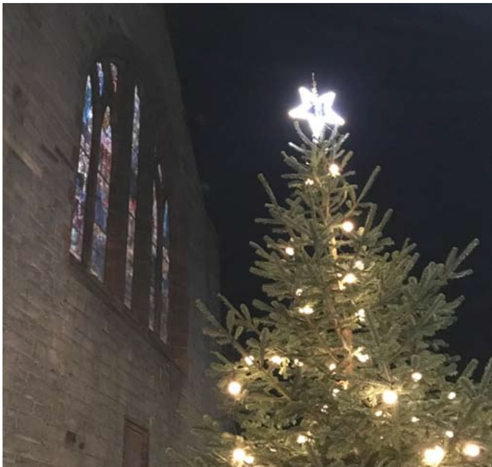
Christmas at Greenbank