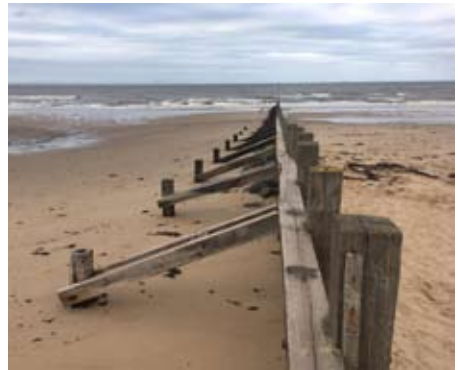
(See Running Club – opposite page) One of our members ran to Portobello