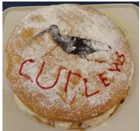
See ‘Men Baking’ article (opposite)