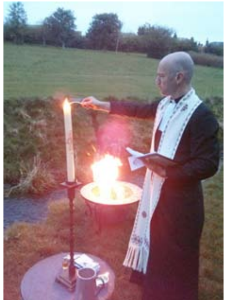
Easter Morning, 5.30am: lighting the Paschal Candle (see also page 6)