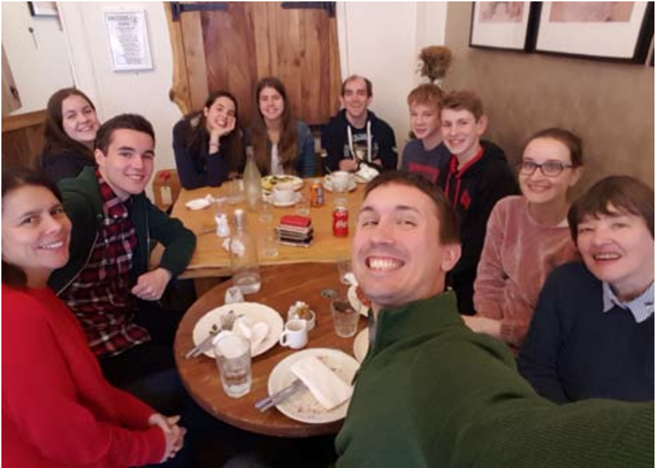
Brunch, October 2018