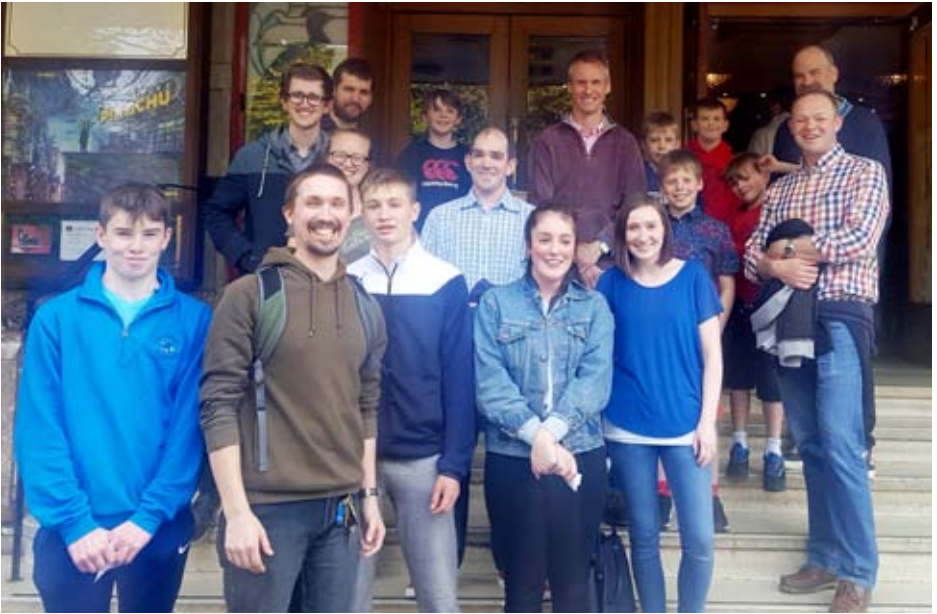
Outside the Dominion Cinema: outing to see Avengers Endgame