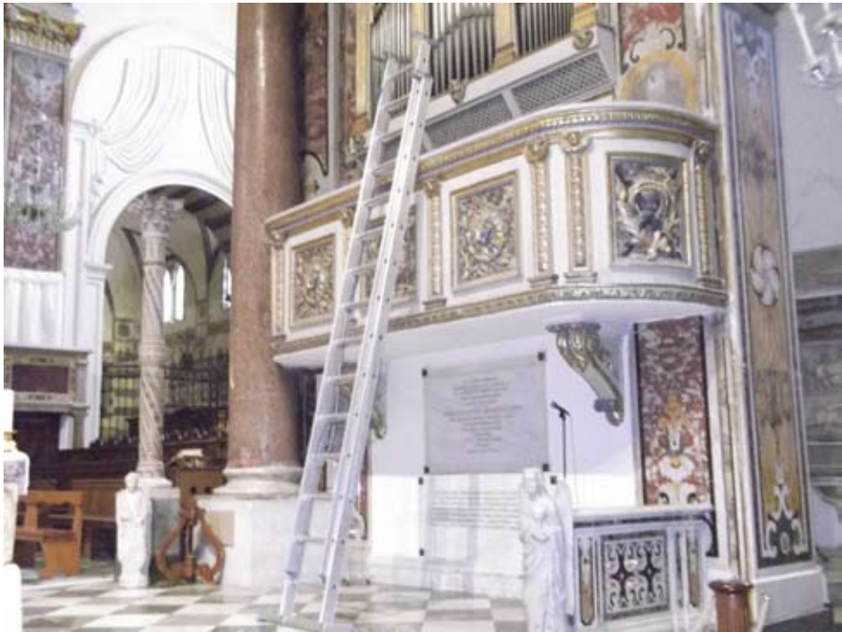
Organ loft in Amalfi Cathedral, Italy: Greenbank treats its organist better than this!