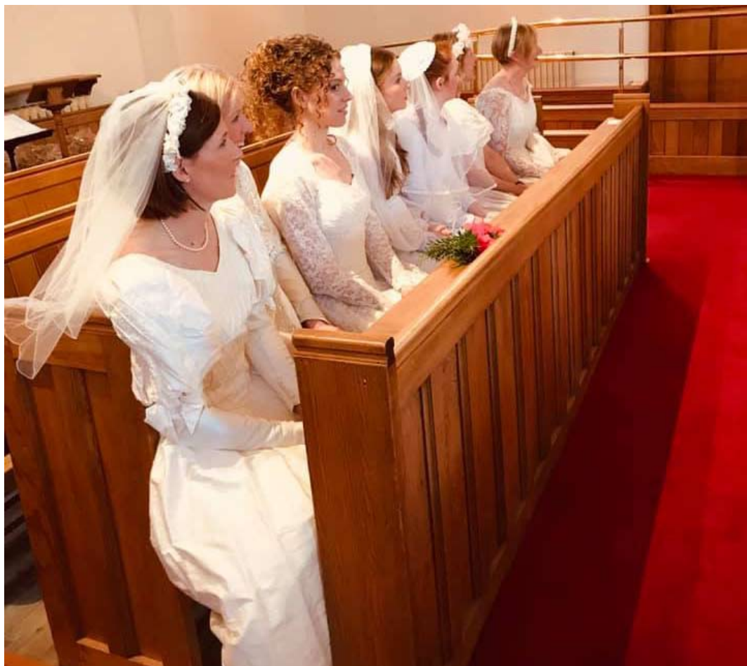
Brides in a row at the YACHT Brides & Bubbles event (see pages 8 and 9)