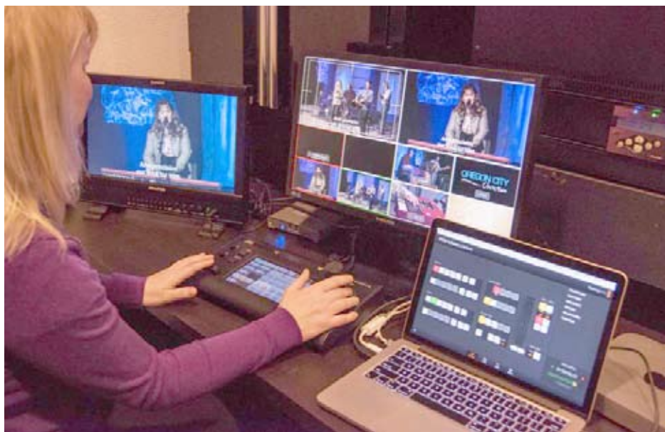
Picture selection will require a control desk in the south transept

Apart from the wider opportunities for spreading the gospel that this work represents, it is also useful for our own congre-