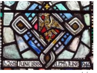
Symbols of the evangelists. (from the Parables Window, Greenbank Parish Church)