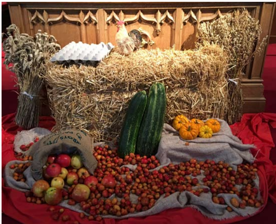
Greenbank Parish Church: Celebration of Harvest, September 2018