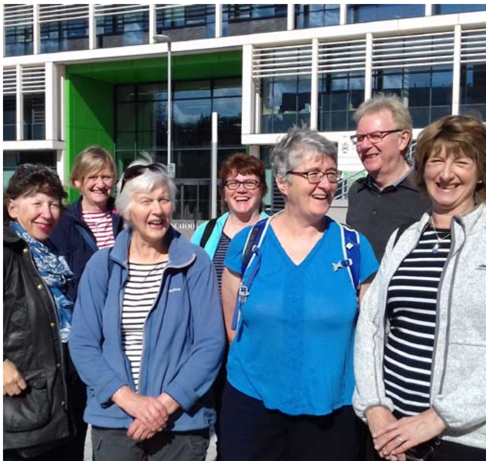
A YACHT walk along the Union Canal (outside the new Boroughmuir High School), August 2018