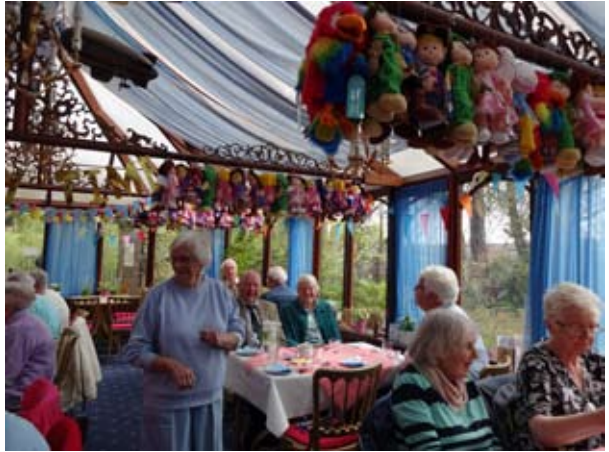
A Summer Outing