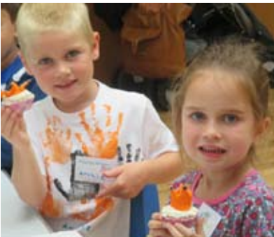
Some images of Holiday Club 2018