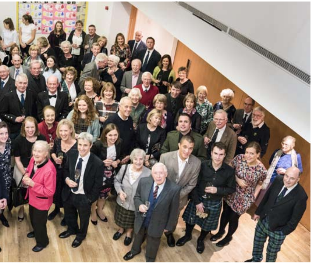
Burns Supper: drinks reception