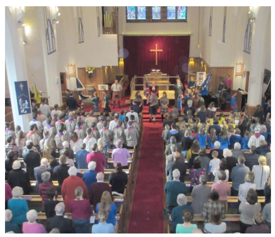
Greenbank's Youth Organisations Service, held on Sunday 4th February 2018 (see page 6)