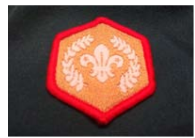
Close-up of Gold award