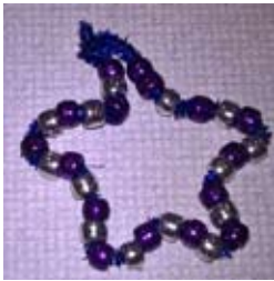
Christmas bead star