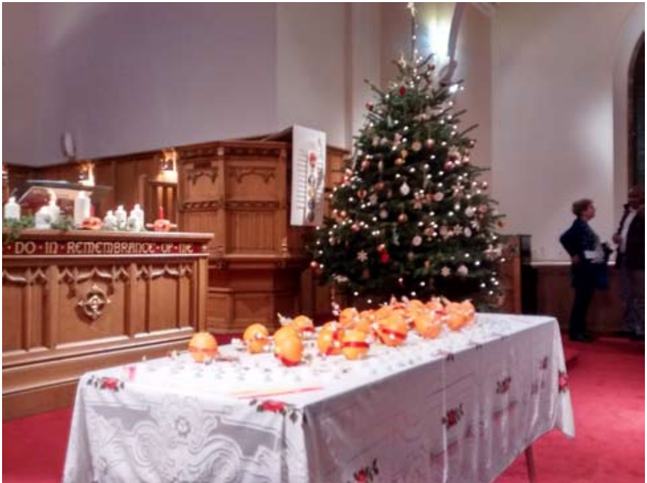
The Sanctuary, ready for the Service

Held at 6.30pm on Christmas Eve at Greenbank Parish Church