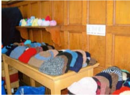
Hats for Bethany Night Shelters