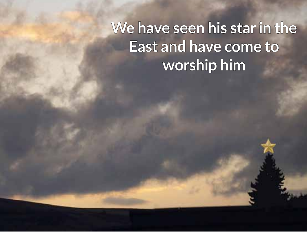
Image from Greenbank Parish Church Christmas Card 2017