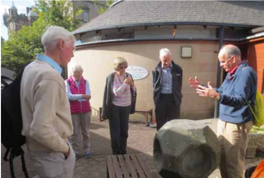
above: Sundials Walk, below: High Street Walk