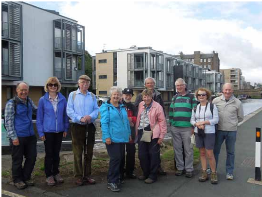
The YACHT Walk along the Union Canal