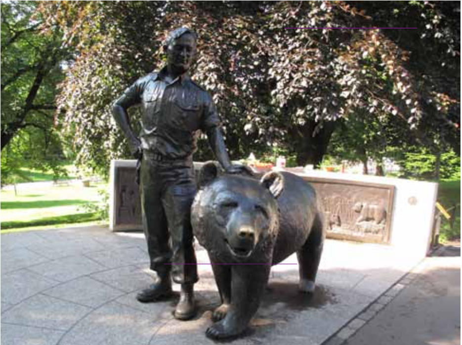
Photo of the Wojtek statue