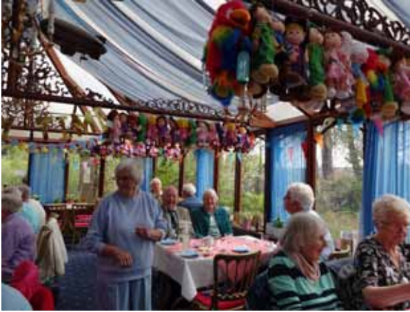
On the Summer Outing