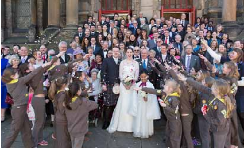
Tawny Owl's Wedding