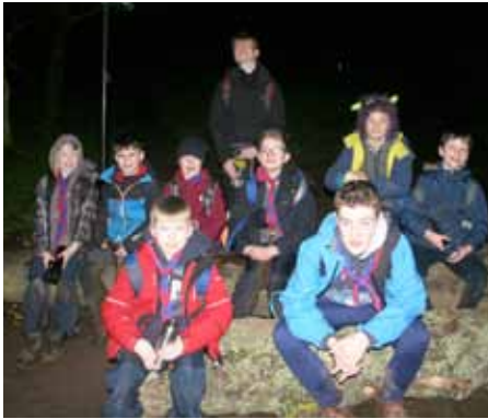
Scouts: Night Exercise