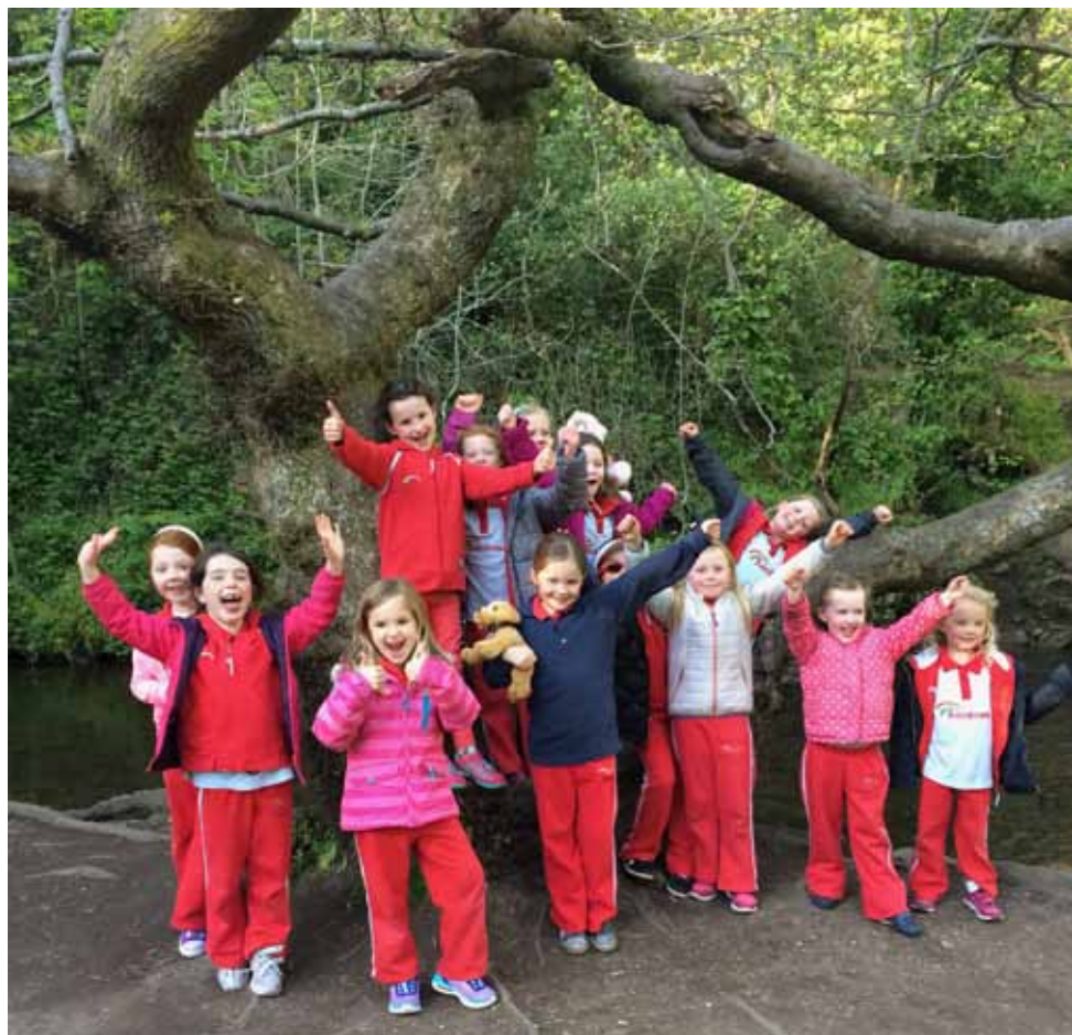
Greenbank Rainbows; see also page 11