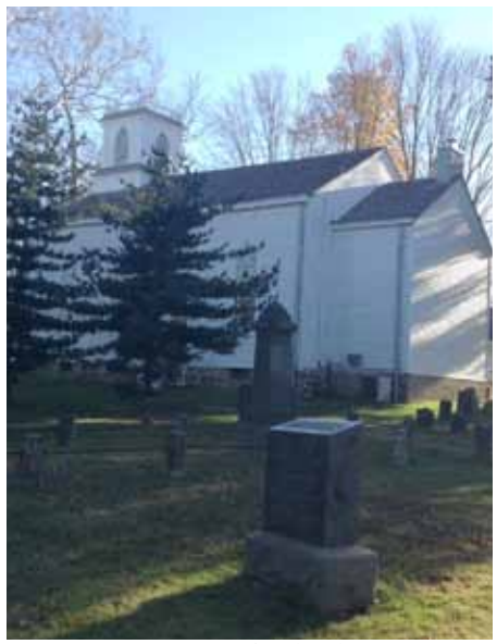
The Church at New Vernon