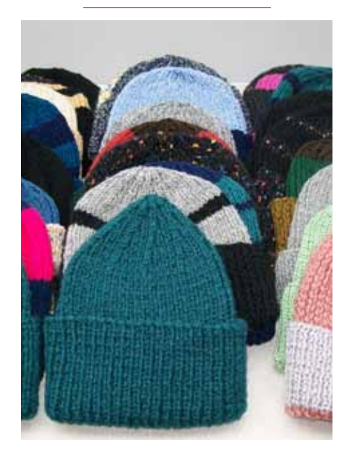
A sample of the Work Party hats

The Church has had links with Scotland off and on since 1894 when Blantyre Synod (then in Nyasaland) set up mission stations. Recently, Blantyre Synod and the