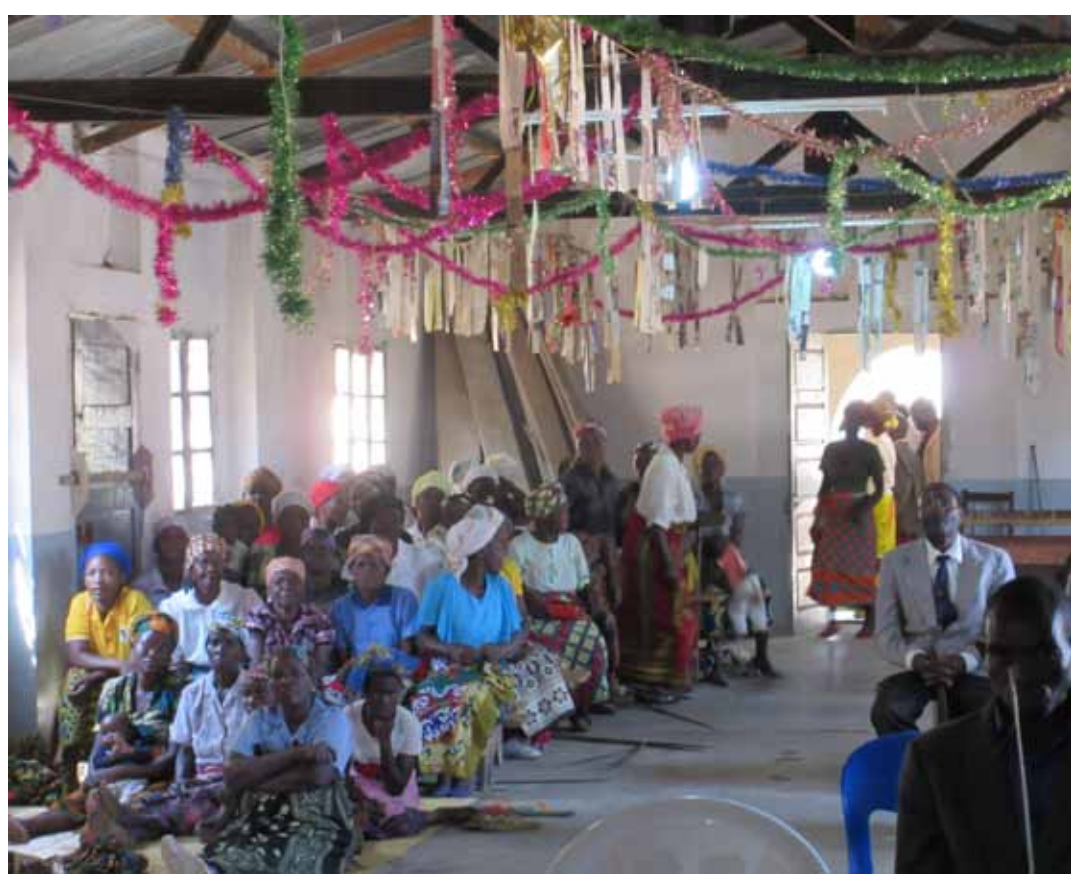
Christian worship in Mozambique (see page 5)