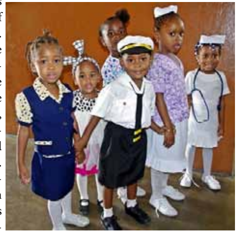
tion for them to achieve their dreams."

up in the uniforms and work clothes of their chosen career. They selected a wide range of careers, including nurse (the most popular choice by far for the girls), doctor, lawyer, fashion model, farmer and minister of religion. We hope that the education the children receive at the schools will lay the founda-