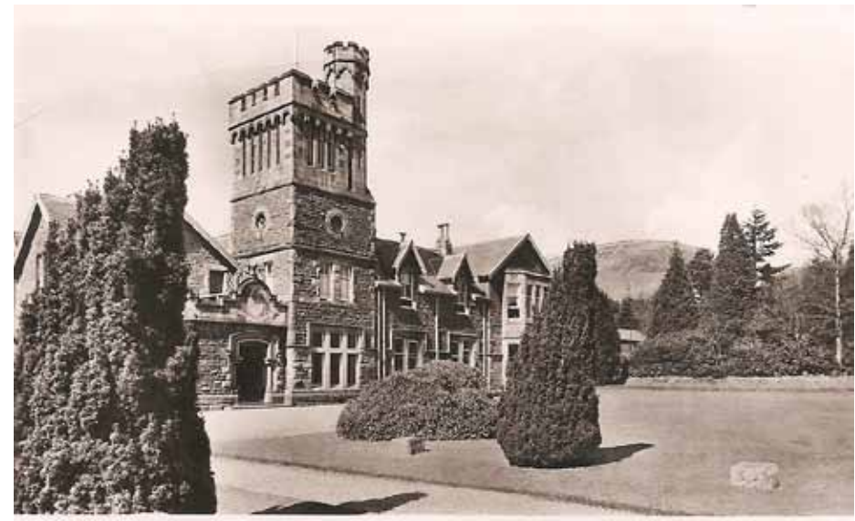
WISTON LODGE Y.M.C.A. CONFERENCE AND HOLIDAY CENTRE