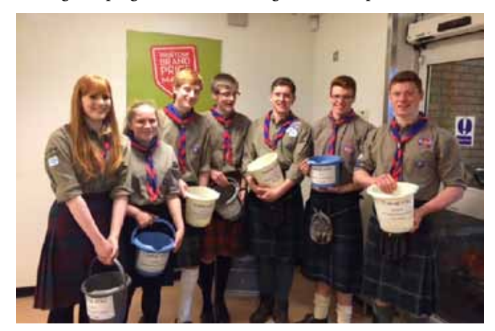
Explorers bag-packing at Waitrose

The secret of the movement's timeless success is informal education with an emphasis on practical and outdoor activities, including camping, woodcraft, hiking and watersports. So, in the