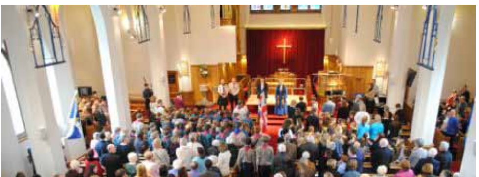
Uniformed Organisations' Service