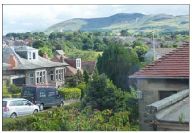
View of the Pentland Hills from the Manse

There is a single car brick built Garage with electric light and power, attached to the south gable elevation. The garage also has connection to water. There is further off-street car parking.