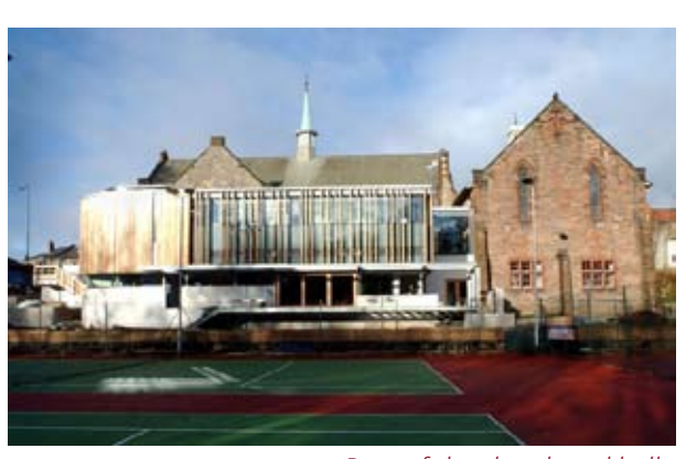
Rear of the church and halls