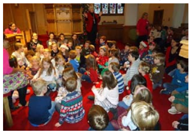
Christmas Event for Children

for primary school aged children. These can attract between 60 and 100 children.