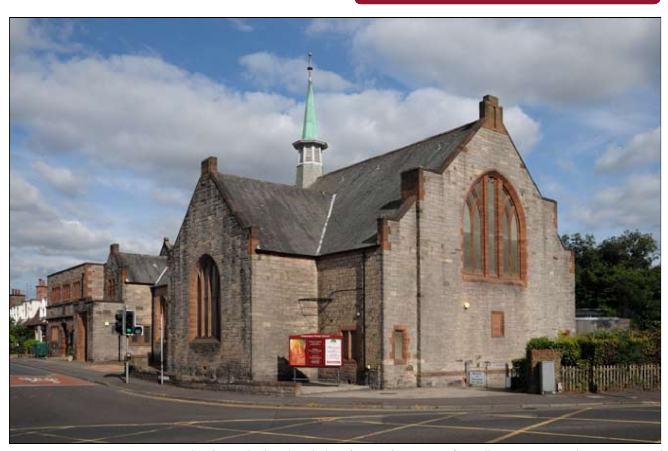
Greenbank Parish Church, Edinburgh – on the corner of Braidburn Terrace and Comiston Road