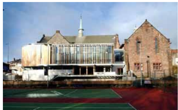
Rear of the church and halls