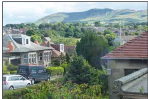
View of the Pentland Hills from the Manse

There is a single car brick built Garage with electric light and power, attached to the south gable elevation. The garage also has connection to water. There is further off-street car parking.