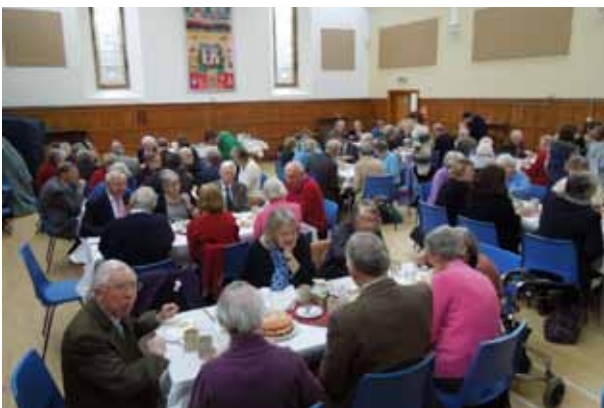
Sunday lunch in the Main Hall