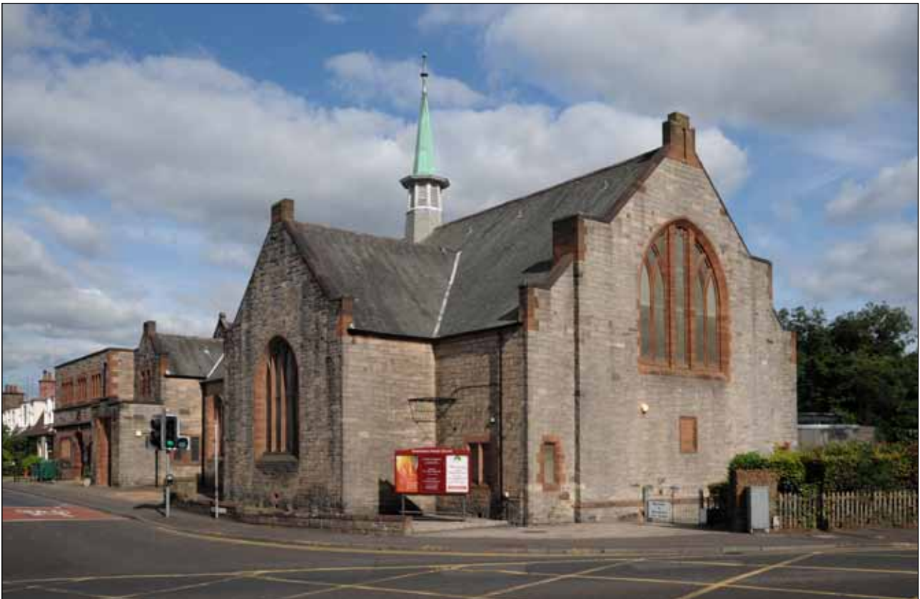
Greenbank Parish Church, Edinburgh – on the corner of Braidburn Terrace and Comiston Road