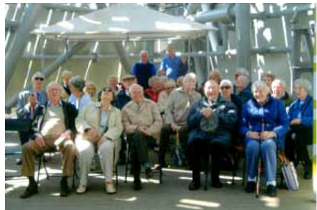
Friendship Club outing to the Kelpies

We run organisations for people of various ages, and provide accommodation for others. We have an active Guild with about 40 members, from our own congregation and outside. The Friendship Club for older people also has members who are not in the Congregation. The Work Party makes and supplies clothes for children to the Edinburgh Clothing Store and ERI baby unit. There are also our