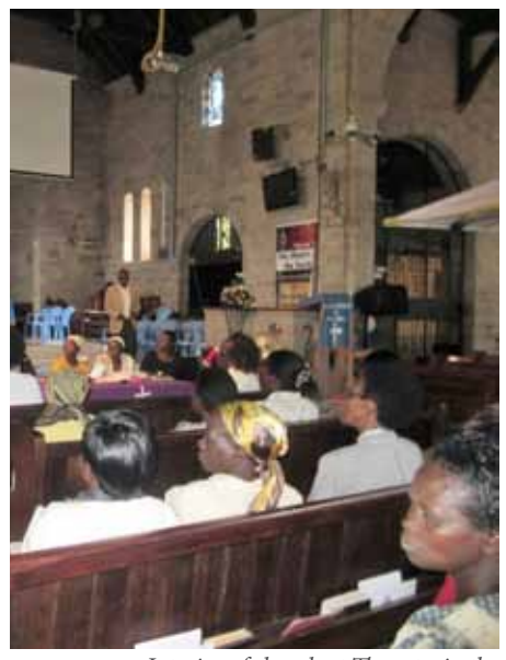
Interior of church at Thogoto, in the Kikuyu area of Nairobi

The visit coincided with the service for the World Day of Prayer