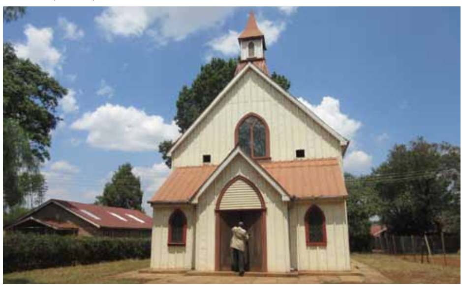
The original Free Church of Scotland Mission church