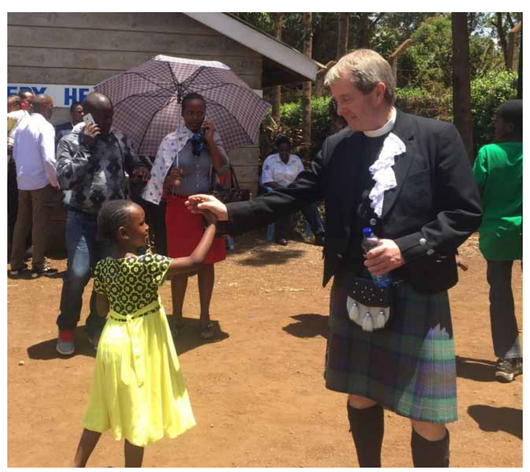
With the Moderator in Kenya (see page 7)

April 2017 Issue 660 Scottish Charity SCO11325