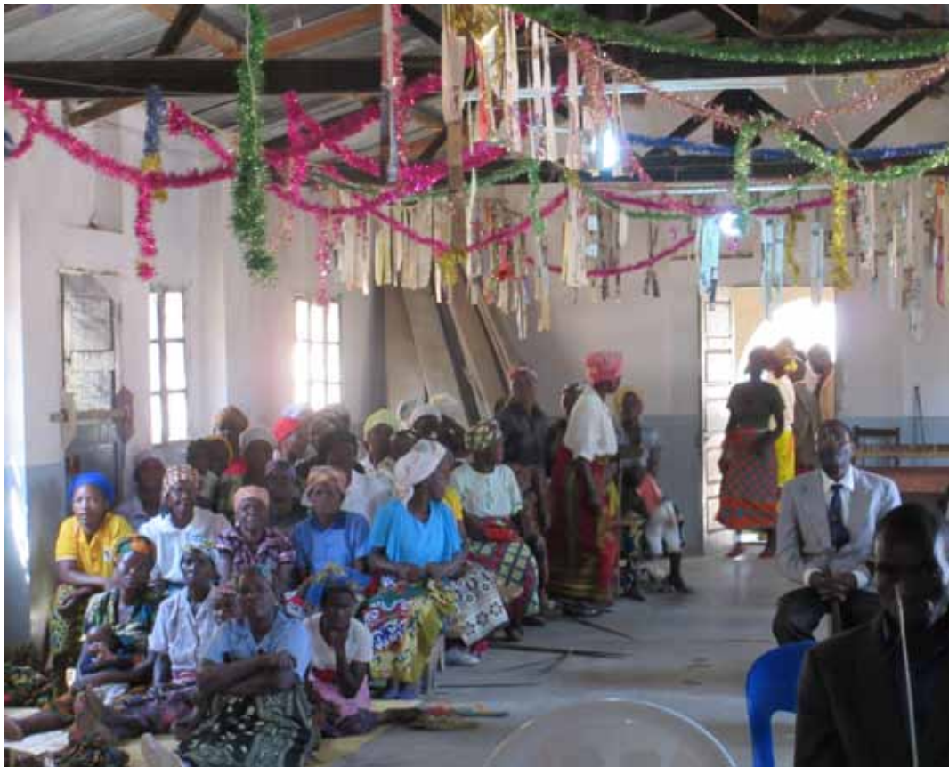
Christian worship in Mozambique (see page 5)